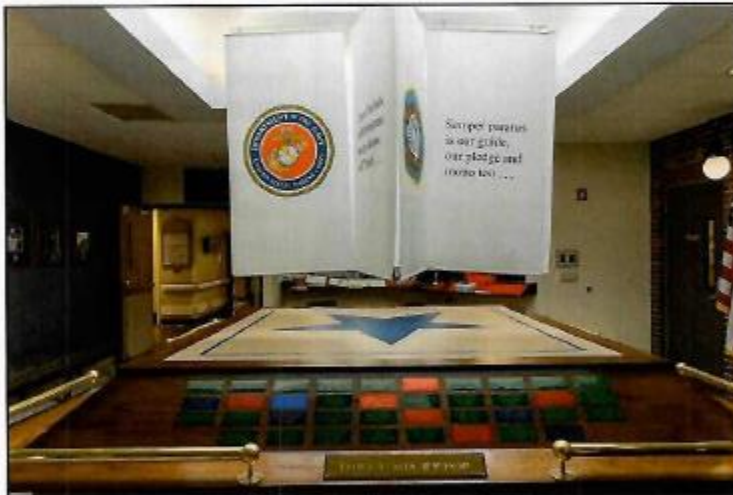
Banners with the emblems and mottos of the branches of the Armed Forces hang inside the front lobby of the home.