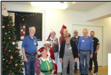
2023 Childrens Christmas Party for Post 201

January 11 — Department Legislative Reception January 11-14 — Department Mid-Winter Conference January 16 — Post Dinner & Meeting January 26 — District Oratorical February 7 — Monthly informal Pot Luck Dinner February 10 — Scouts Pancake Breakfast