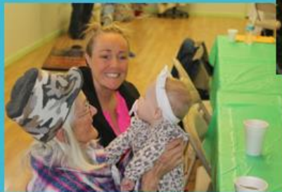
2023 Childrens Christmas Party for Post 201

https://www.facebook.com/meridianpost113