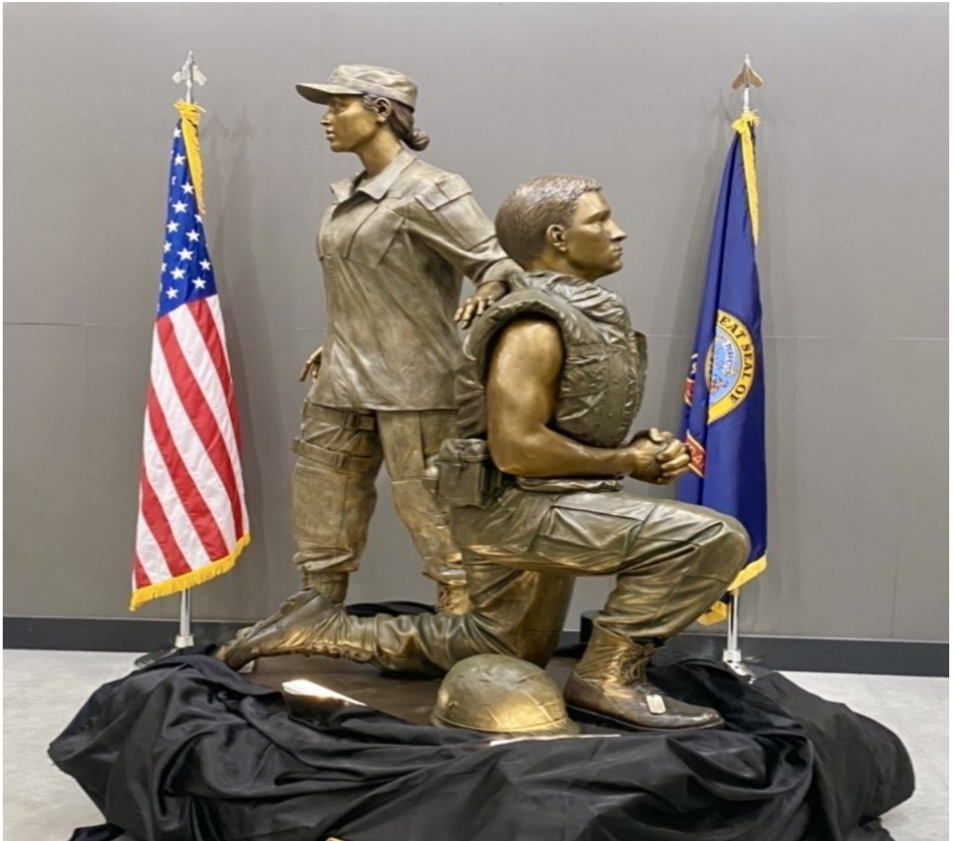
STATUE AT IDAHO STATE VETERAN'S CEMETERY