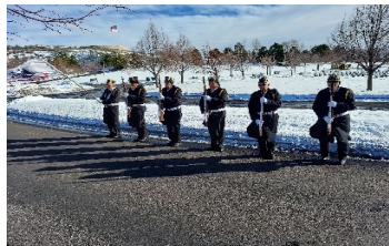
Post 113 Honor Guard at Idaho State Veterans Cemetery

The United States Congress adopted a resolution on June 4, 1926, requesting that President Calvin Coolidge issue annual proclamations calling for the observance of November 11 with appropriate ceremonies. [6] A Congressional Act (52 Stat. 351; 5 U.S. Code, Sec. 87a) approved May 13, 1938, made November 11 in each year a legal holiday: "a day to be dedicated to the cause of world peace and to be thereafter celebrated and known as 'Armistice Day'". [4]