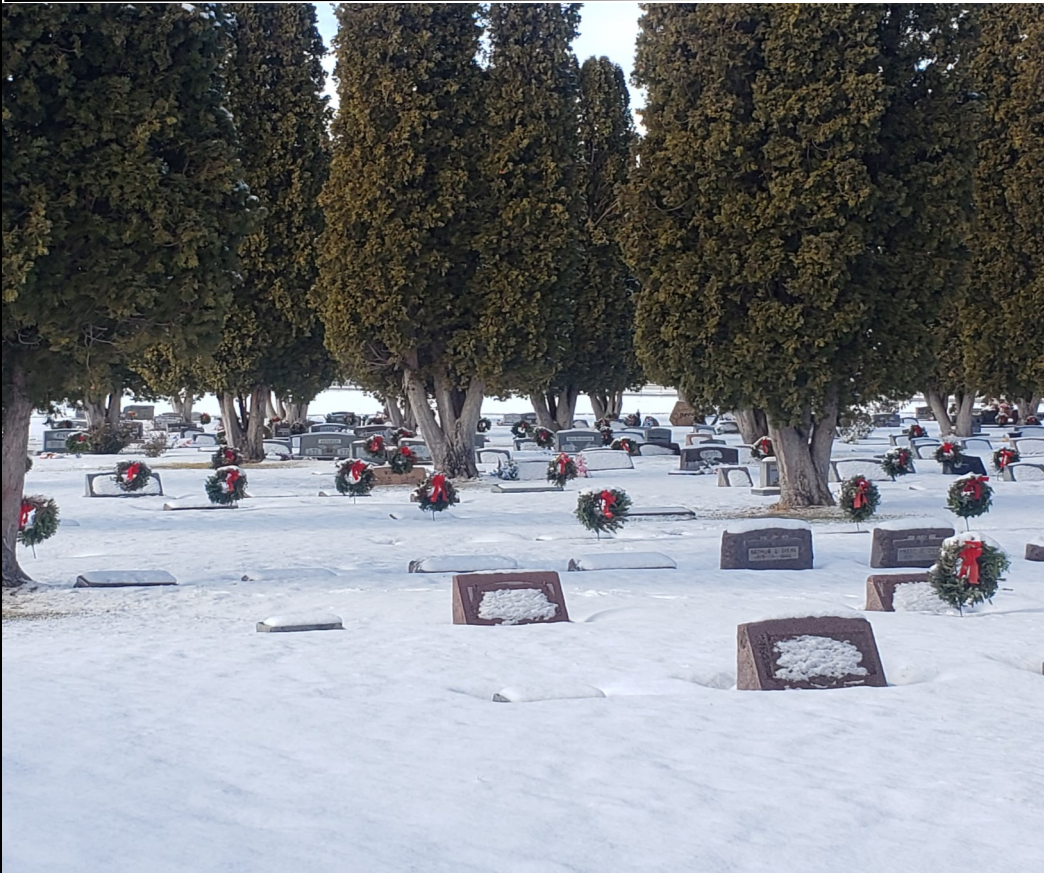
Wreaths Across America at Kuna Cemetery put up by Post 142